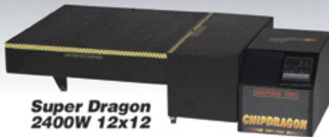
Super Dragon 2400W 12x12