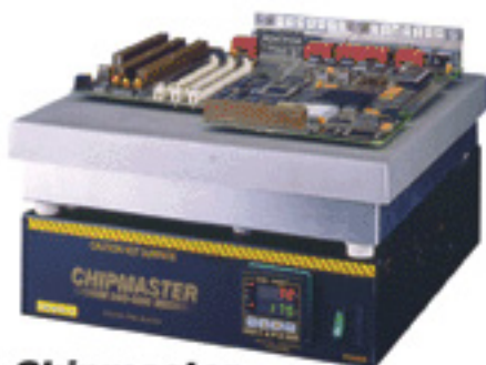
Chipmaster Hot Plate 1800 W 12x12

Worlds largest selection. Most powerful available. All digital.