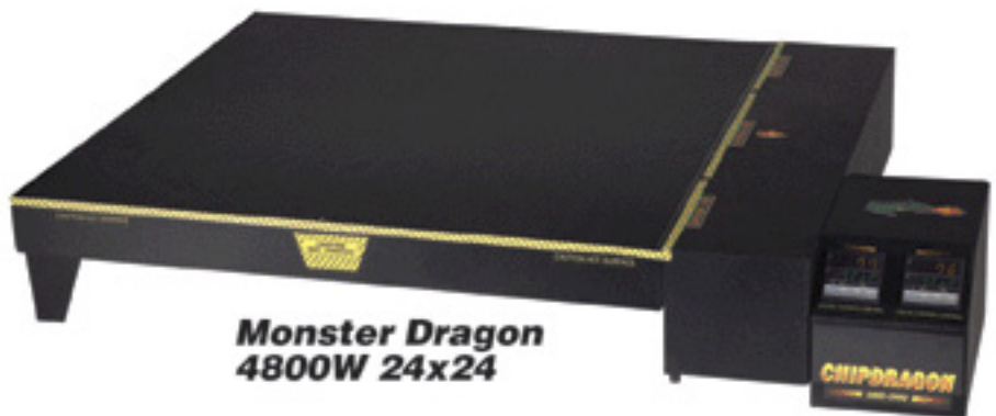
Monster Dragon 4800W 24x24